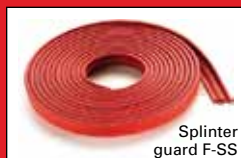
Splinter guard F-SS