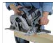
Stable aluminum base

PROTOOL high performance circular saws are well-known for their powerful motors, robust gears, and durable metal casings, resulting in long-lasting, reliable saws that are easy to use. Capable of cutting up to a 60° angle, and then returning to the 90° position without fine tuning or re-squaring. Depth is adjusted precisely with the use of the unique front height guide pole rather than a traditional front hinge system, while safety is increased by the superior blade guard. The large aluminum base provides for stable and accurate cuts.