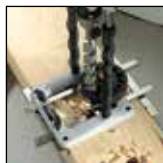
Lateral guides are standard with each drill guide

Precise drilling can be achieved by the use of these sturdy drill guides. Take the guess work out of drilling with accurate depth gauges, centering plates and a clearly marked contact point. The GDP "A" models offer stepless angles up to 45° and can be securely clamped to the timber with the optional clamps and clamp extenders. Just one more gem of the PROTOOL System that allows you to produce accurate timber connections.