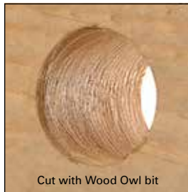
Cut with Wood Owl bit