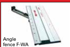
Angle fence F-WA