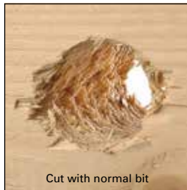
Cut with normal bit