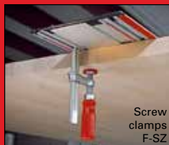
Screw clamps F-SZ