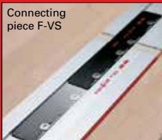
Connecting piece F-VS