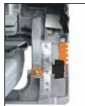
Precise angle cut guide