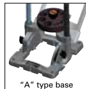
"A" type base

- Odd size centering plate (7 - 27mm diameter holes)